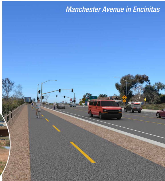
Manchester Avenue in Encinitas

To help reduce freeway noise for nearby residents, Caltrans is proposing to construct some sound walls on private property. In areas with views, transparent sound walls will be offered to residents.