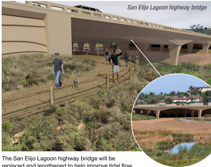
San Elijo Lagoon highway bridge

The San Elijo Lagoon highway bridge will be replaced and lengthened to help improve tidal flow in the lagoon. The wider bridge will accommodate an additional carpool lane in each direction. In addition, a new bike/pedestrian suspended bridge will link the south and north sides of the lagoon, and will connect to a Class 1 bike path on Manchester Avenue, providing access to the San Elijo Lagoon Nature Center.