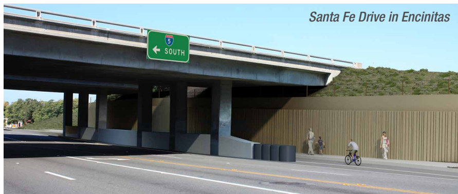
Santa Fe Drive in Encinitas

Build NCC includes local bike/pedestrian path improvements in Encinitas and Carlsbad. The interchanges at Encinitas Boulevard and Santa Fe Drive will be upgraded with new bike and pedestrian paths.